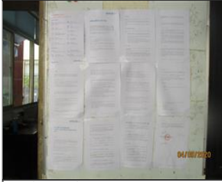
Photo of the code of conduct on display amfori BSCI COC.JPG