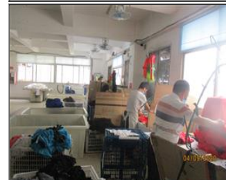
Photo of non-conformity 7.9.No heat warning sign.JPG