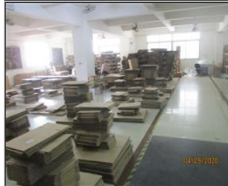
Photo of the inside of the main production hall Packing material area.JPG