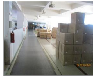
Photo of the inside of the main production hall Finished goods area.JPG