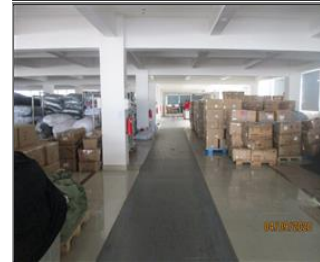
Photo of the inside of the main production hall Stock material warehouse.JPG