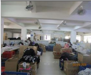
Photo of the inside of the main production hall Packing area.JPG