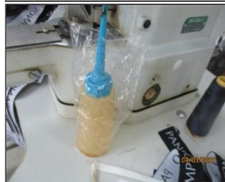
Photo of non-conformity 7.7. No safety label.JPG