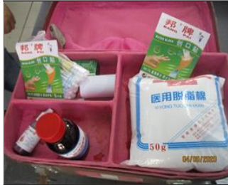
Photo first aid facilities First aid kit.JPG