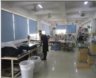
Photo of the inside of the main production hall Sample making room.JPG