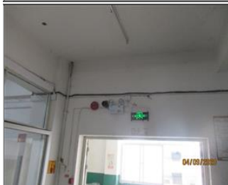
Photo of fire safety equipment Exit mark and emergency light and fire alarm.JPG