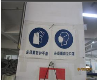
Photo of the personal protection equipments (if applicable) PPE warning sign.JPG