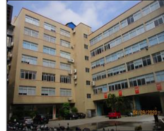
External photo(s) of the production unit(s) Production building.JPG