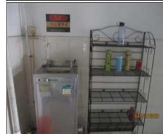
Photo of the sanitary facilities Drinking water.JPG