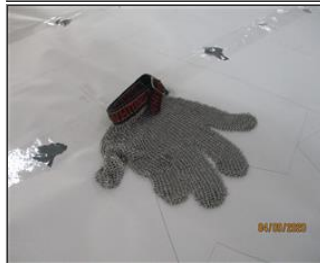
Photo of the personal protection equipments (if applicable) Steel glove.JPG