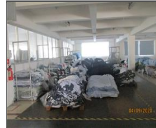
Photo of the inside of the main production hall Raw material area.JPG