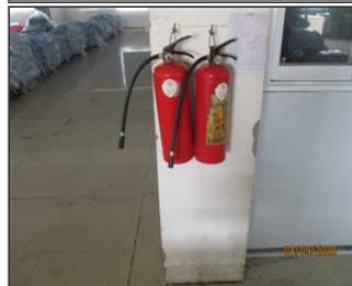
Photo of fire safety equipment Fire extinguishers.JPG