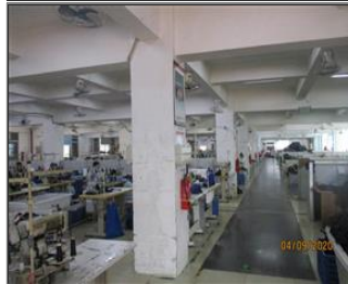
Photo of the inside of the main production hall Sewing workshop.JPG