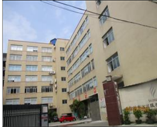
External photo(s) of the production unit(s) Factory entrance.JPG