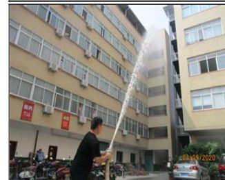
Photo of fire safety equipment Fire hydrant tested.JPG