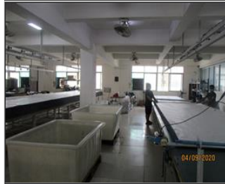
Photo of the inside of the main production hall Cutting area.JPG