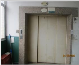
Photo of the inside of the main production hall Cargo lift.JPG