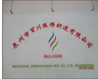
External photo(s) of the production unit(s) Factory name.JPG