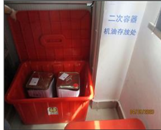
Photo of chemical storage room (if applicable) Sewing oil storage area.JPG