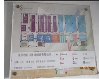
Photo of fire safety equipment Evacuation map.JPG