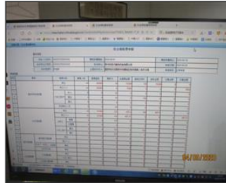
Photo of non-conformity 5.5. Insufficient social insurance.JPG