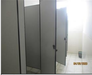
Photo of the sanitary facilities Toilets.JPG