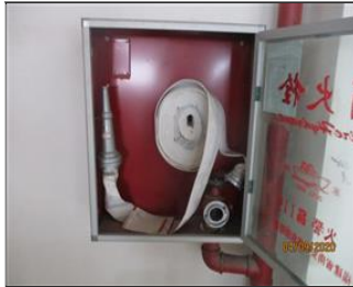
Photo of fire safety equipment Fire hydrant.JPG