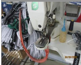
Photo of non-conformity 7.17.No needle guard.JPG